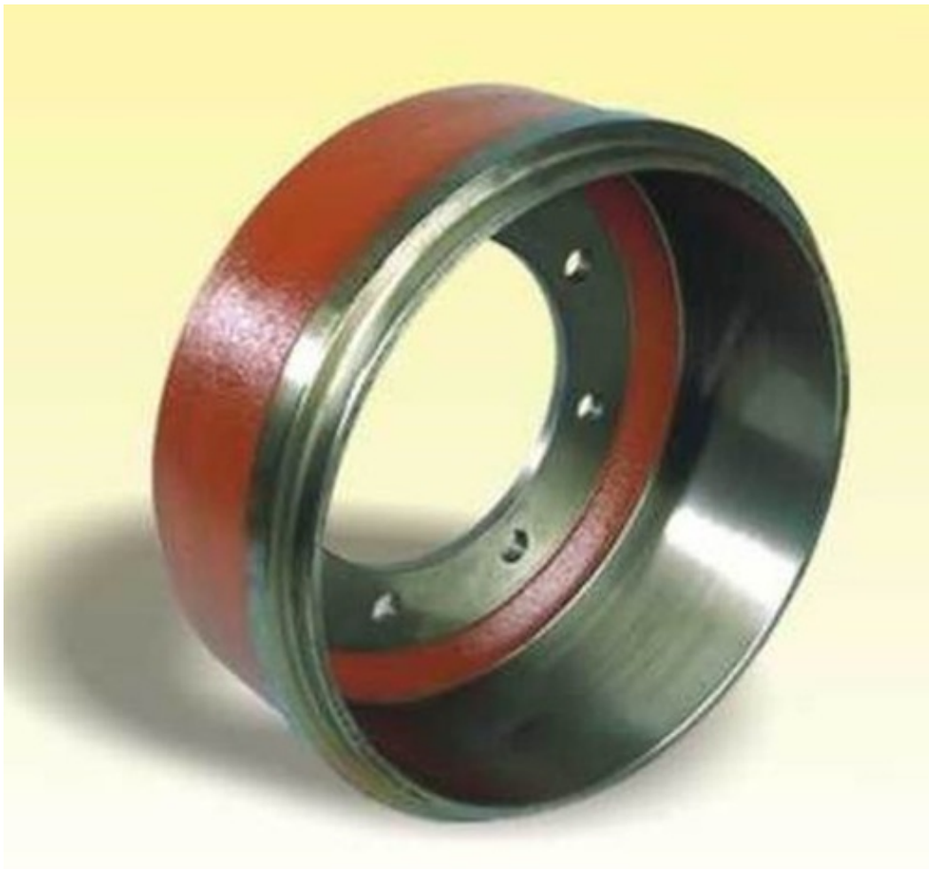
Isuzu Brake Drum