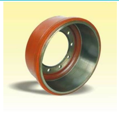
Hino Brake Drum