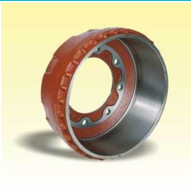
Fuso Brake Drum

Since 1978, Royal Metal Technology Co., Ltd. has been specializing in making brake drums, water pumps and fly wheels in Taiwan. Offering mainly parts and components for Scania, Volvo trailers and Japanese medium/heavy-duty trucks including Nissan, Fuso, Hino, Toyota, Isuzu, Daihatsu, Mazda etc., we also cast items based on sho ... [more]