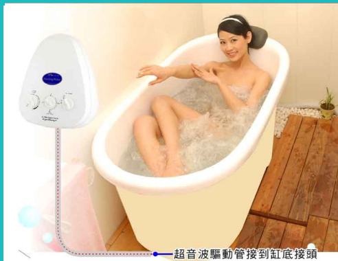
Ultrasonic Water Aerator

Gold and Bronze Medal winner for bath and healthcare equipment respectively at the 2009 Taipei INST Assisted by ITRI of Taiwan, and with products having been clinically studied by the Taipei Medical University