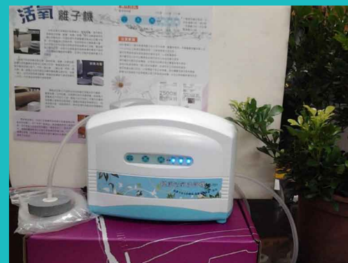
Three-in-one Water Purifier