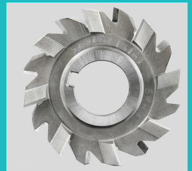
STAGGERED SIDE MILLING CUTTER