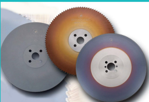
SOLID TUNGSTEN CIRCULAR SAWBLADE

S+A U-YICHANG INDUSTRY CO., LTD. was established in 1990. And mainly concentrated on HSS small diameter slotting circular saw blade, side milling cutters and solid tungsten metal circular saw blade. The company is striving to innovate and develop products. We also import the brand of KINKELDER HSS circular saw blade from Holland and we are the only one agent in Taiwan. We earn positive evaluations from customers for high quality and efficiency,