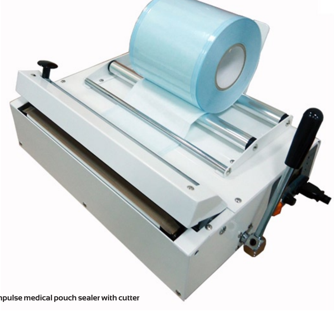
Impulse medical pouch sealer with cutter