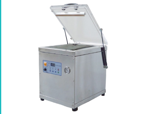
Chamber vacuum sealer