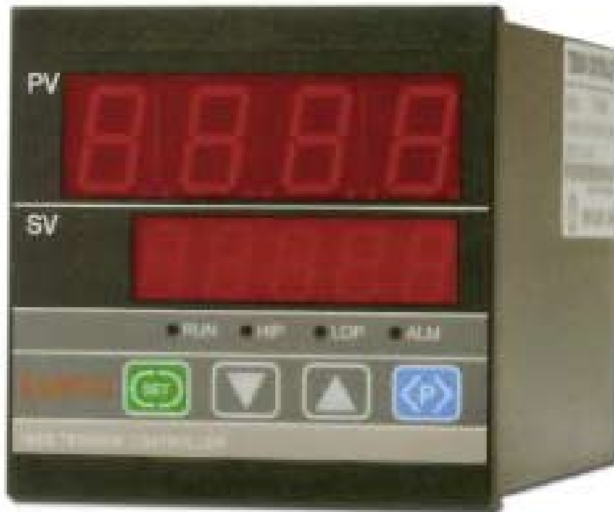
Digital Tension Controller