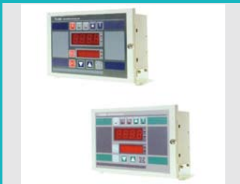
Universal Tension Controller

Hot Melt Coating Equipment and Compound Systems Cold glue coating and laminating machine series Micro-Computer Slitting Machine Microcomputerized slitter & sheeter Microcomputerized center-surface slitter & rewinder