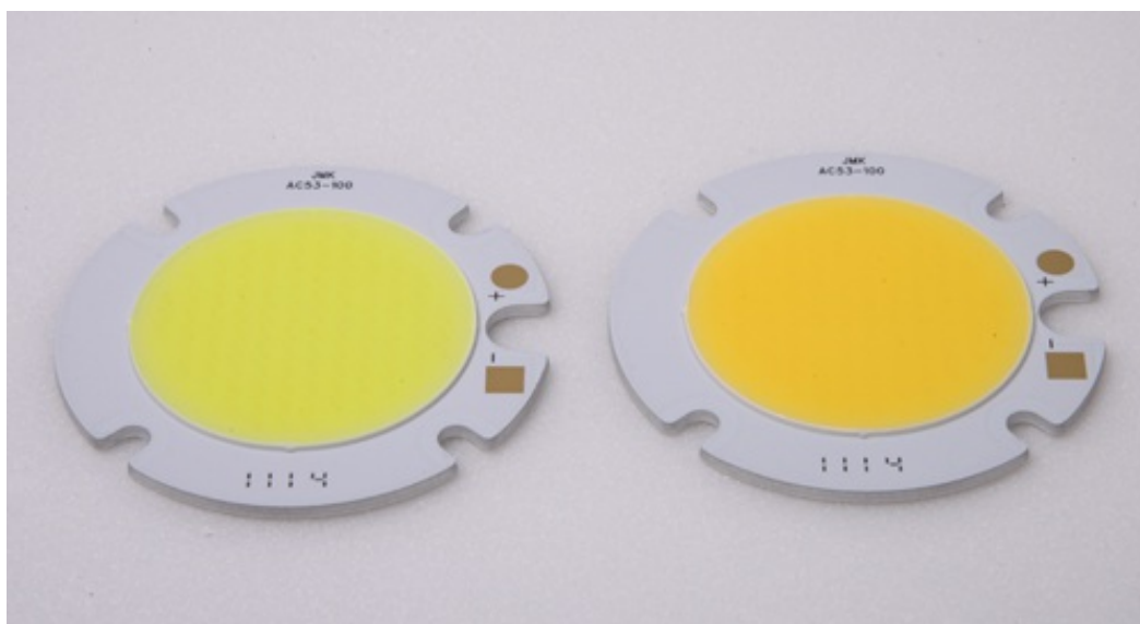
10W Round Shape COB LED Module