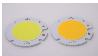
17W Round Shape COB LED Module

JMK Optoelectronic Co., Ltd, founded in 2008, has its manufacturing facility setup in New Taipei City, Shulin Industrial Park and has been servicing worldwide Lighting company ever since. JMK is specialized in the chip-on-board (COB) technology, which die and wire bonds LED chips directly on aluminum or copper based MCPCB. With the precise control ... [more]