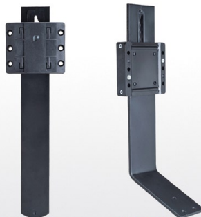
LW374-HU1 升降背板 Back stem with height adjustment