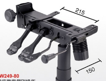
LW249-80 椅座靠背個別操作，無段傾仰調整整張坐椅可前後擺動更增舒適 A tilter with spring tension control. Seat & back are independently adjustable and can be locked infinitely at desired tilting angles. Forward tilting is optional with one-lever action. Suitable for chairs of big size.