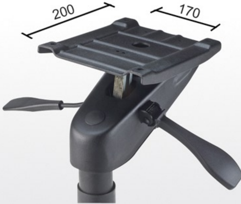
OA Chair Bases