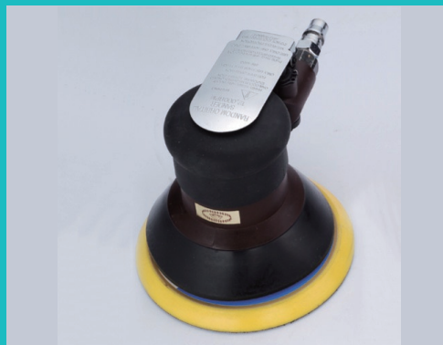
Palm Orbital Sander