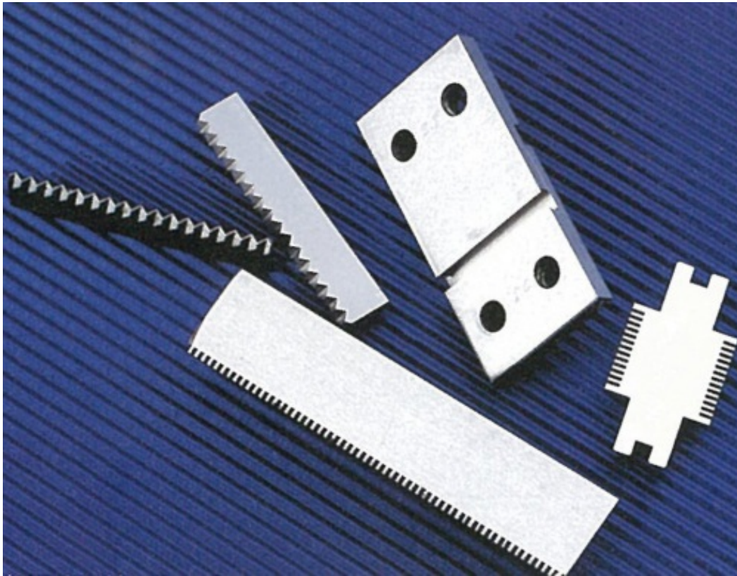
Cutters for confectionery packers