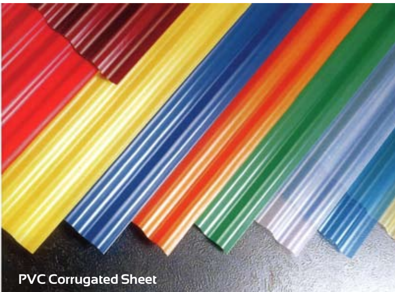
PVC Corrugated Sheet

PVC , Polycarbonate , White Mud Weather Resistant Reinforced Plastic Corrugated Sheet