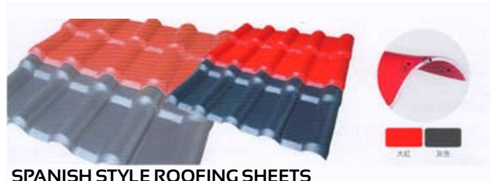
SPANISH STYLE ROOFING SHEETS