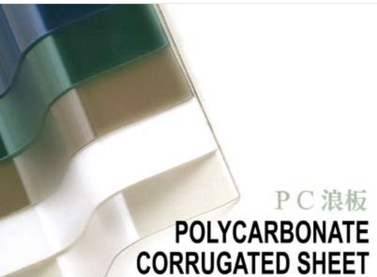
PC 浪板 POLYCARBONATE CORRUGATED SHEET

It is the most excellent and modern construction material and the necessity of manufacturing plants and residential buildings. It not only can block, select lighting, apply indirect lighting, adjust lighting and also use as room partition, it also can be used in interior and exterior decoration, garden house, pavilion.