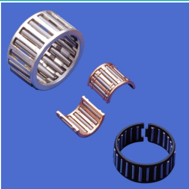
Connecting Rod Needles

Shin Chang Bearing Co., Ltd. was founded in 1989 to develop and manufacture bearings, rollers, piston pins, and assorted bearing-related products. Accepting OEM orders, we now also produce according to changing market demands, and have started to export our products. New products are regularly developed. Providing ISO- and QS-certified products, wh ... [more]