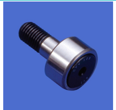
Stud-Type Track Rollers (of metric specifications)