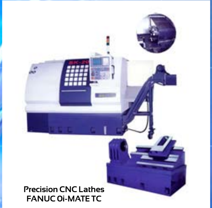
Precision CNC Lathes FANUC Oi-MATE TC