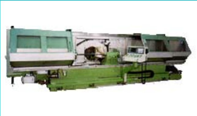
CNC Screw Grindier Machine SKG3000

SAN KAO AUTOMATION INC. is dedicated in "Gun Drill, CNC Drilling Machines, CNC Lathes, Machining Centers Horizontal, Big CNC Heavy Duty Lathe" with operations in Taiwan.