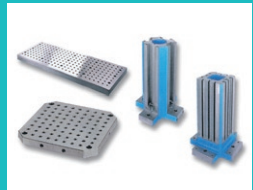
MC SUB TABLES