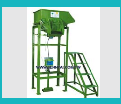
Vibratory Bin Feeder (Hopper)