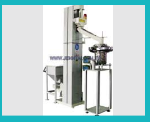
Automatic Elevator Conveyer