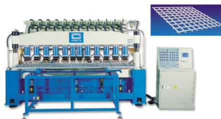
Manual Multi-Spot Welding Machine