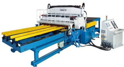
Column Type Multi-Spot Welding

Welding machine :We would like to introduce ourselves as the manufacturer and specialized in making welding since 1972, started at welding machine for metal wires. In 1974, we developed the welding machine for fan grille.We upgraded the machine to be automatic instead of semi-auto operation. Also kept on improving the whole plant equipment for fan network welding.