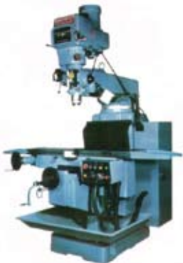
Vertical Milling Machine

Machine Works Of Eumega Groupeumega Was Established In 1993. The Main Products During Its Beginning Stage Were Vertical Turret Milling Machines And Vertical&Horizontal Milling Machines. Eumega Milling Machines Have 14 Years Of Experiences, Being Enjoy Good Reputations From Customers Around The World, Like U.S.A.