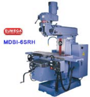
Vertical & Horizontal Milling Machine