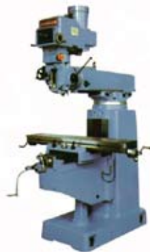
Vertical Milling Machine