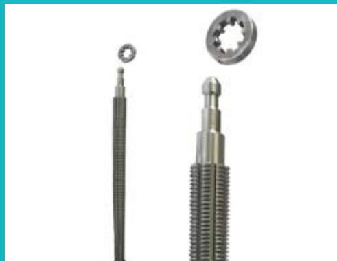
Internal Forming Broach