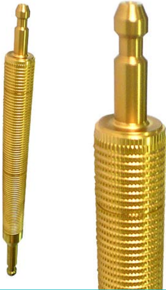
Ring Gear Broach