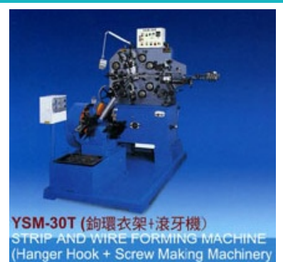
STRIP AND WIRE FORMING MACHINE