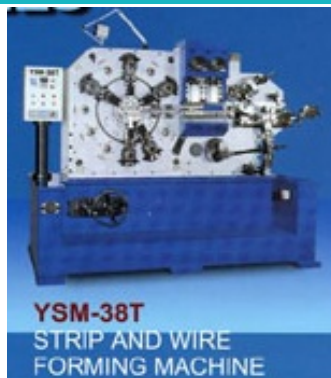
STRIP AND WIRE FORMING MACHINE