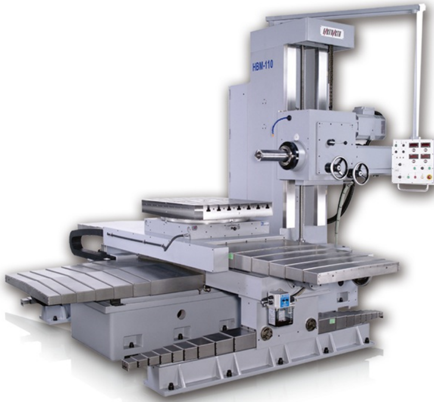
Horizontal Boring & Milling Machine