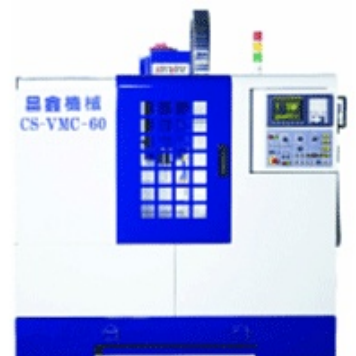
Vertical Machining Centre