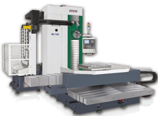
CNC Horizontal Boring & Milling Machine

Chung Sing Machinery Co., Ltd. is a leading manufacturer of machining center, including CNC vertical machining center, CNC milling machine, horizontal boring machine, bed-type vertical boring and milling machine, bed-type vertical with horizontal boring & milling machine, vertical & horizontal milling machine.