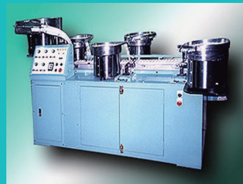
Single-head Watery Pen Assembly Series