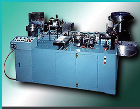
Gel Pen Assembly Machine