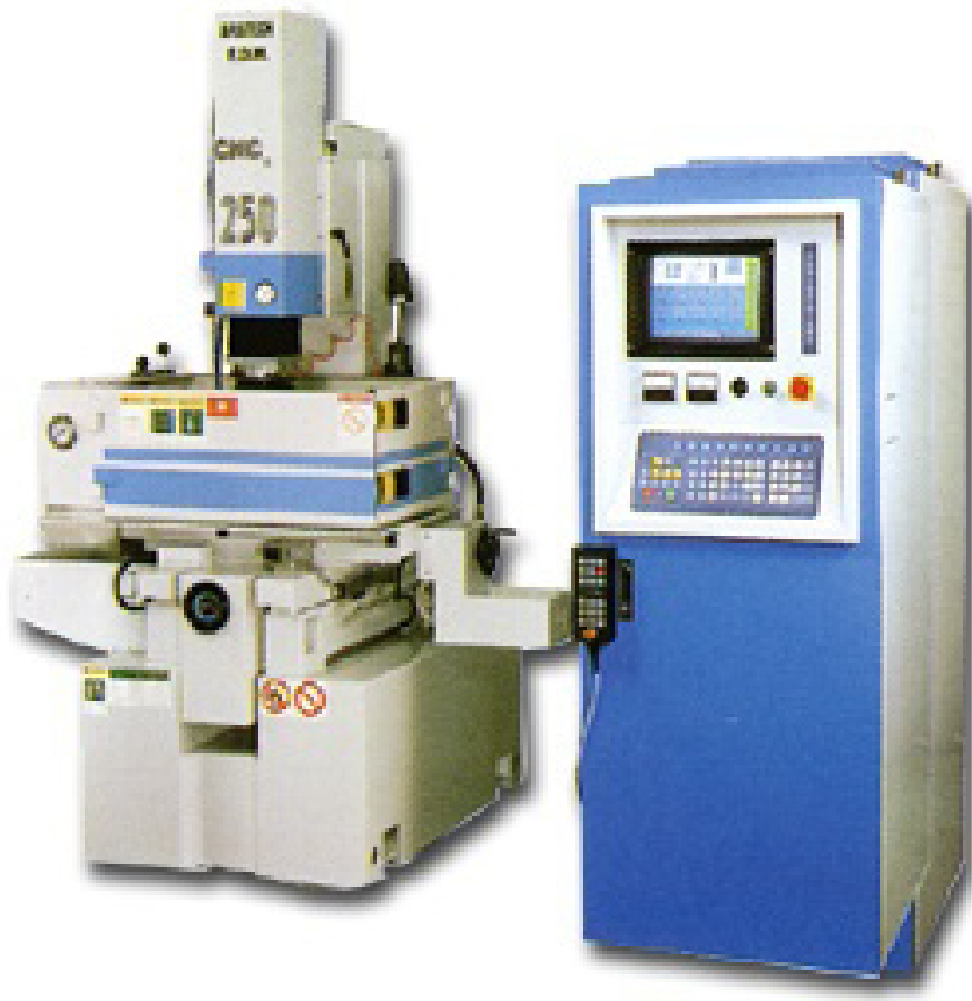
CNC EDM Series