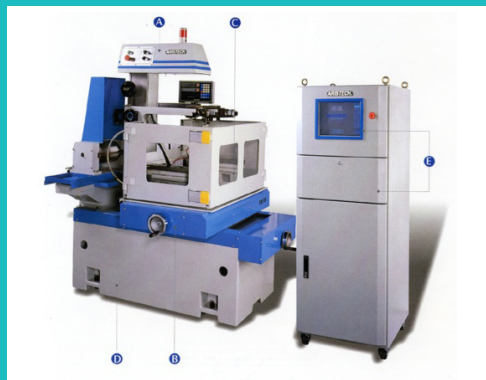
CNC Wire Cut E.D.M.