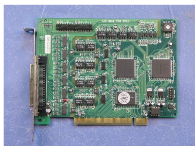
4-axis Quadrature encoder and counter card

JAC (JS Automation Corp.) is a PC control card maker, specialized in motion control technology. JAC offers: 1. Motion Control Card 2. Quadrature Encoder Counter Card 3. Digital I/O Card 4. Analog I/O Card To make a one-stop solution to the client, JAC also provides CPU cards and automation components such as servo motor/driver, step motor/dr ... [more]