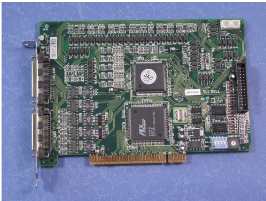
4 axes motion control card