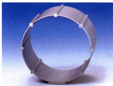
Wire cutting process