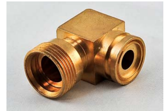
Brass Machine Parts

The firm stresses its belief that customer growth brings growth and success to Nan Dee itself, and so it will keep striving to solve customers' problems and fulfill all of their requirements.