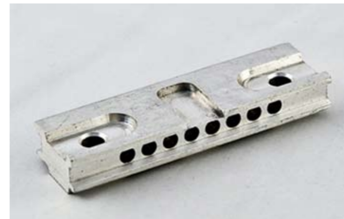
CNC Milling Part

Using precision measuring equipment together with intelligent administration and quality-control systems, Nan Dee's advanced machines and high-efficiency processes turn out CNC-precision turned parts and milled parts.