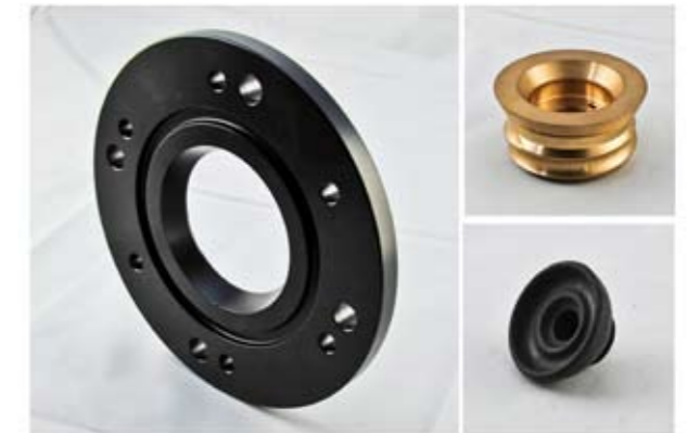
Precision Machined Parts

The firm stresses its belief that customer growth brings growth and success to Nan Dee itself, and so it will keep striving to solve customers' problems and fulfill all of their requirements.