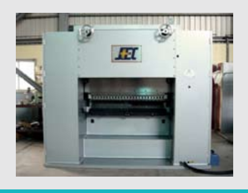
HIGH SPEED EXPANDED METAL MACHINE

JUN-EN, one of the leading companies in Taiwan, has been in the metal mesh industry for over twenty years. During these years, we have been servicing thousands and thousands of satisfied clients, both international and domestic.