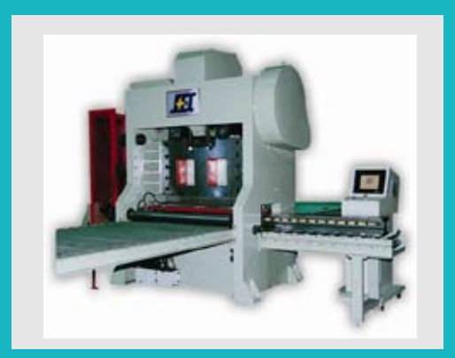
PLP1250H PLANO-TYPE PERFORATED METAL MACHINE