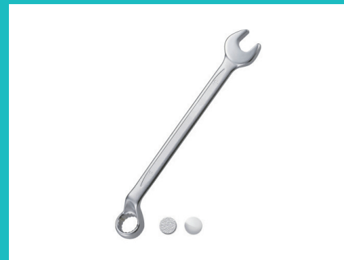
Offset Combination Wrench-CWEG75