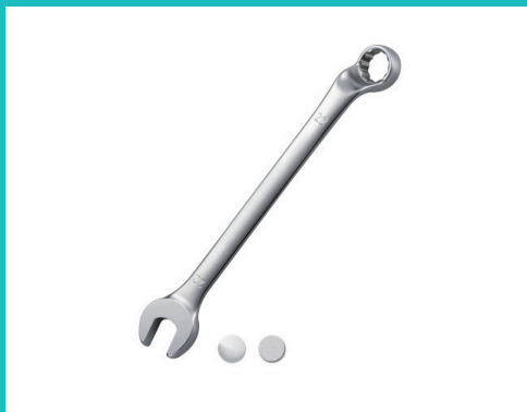
Offset Combination Wrench-FCWEG75