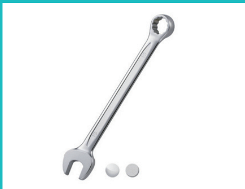
Quick Combination Wrench-PTQ only 8-9(mm).

Our company was established in 1986 and mainly on forging for hand tools. Our company adheres to the high quality of the product and to provide customers with good service, We have set-up finished product department in 2000 and through ISO authentication in 1998 and many series of product according to DIN, ISO and ANSI standard. Finished product divide into surface finish of mirror, matte, silvering, and manganese phosphate.