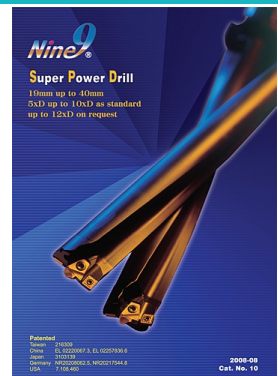
Super Power Drill