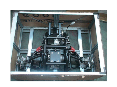
Conversion kits packing