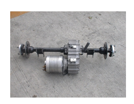
Electric motor conversion kits