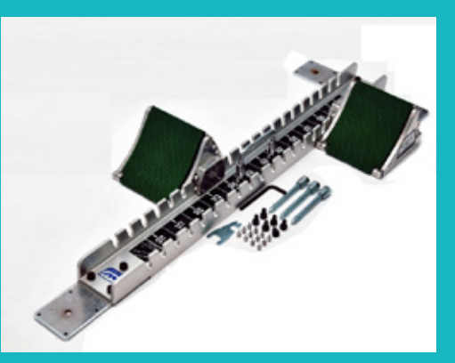
Pro Olympic Grade Starting Block