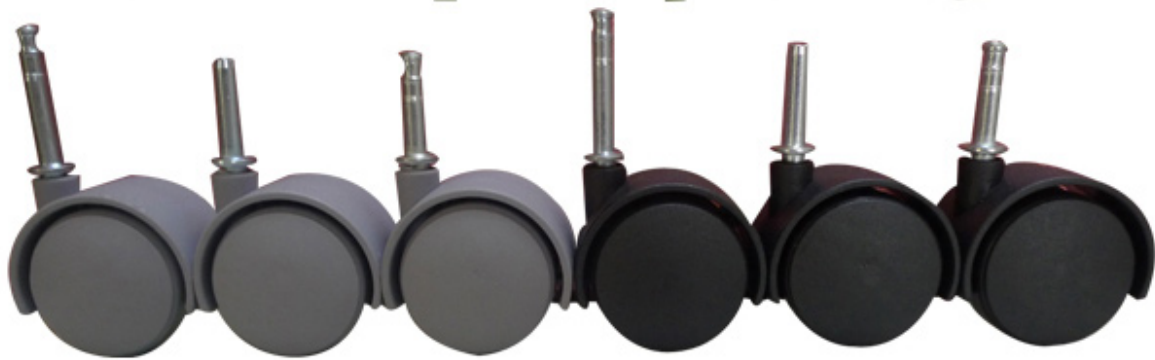
Auto Plastic Caster (5 Parts) Assembling Machine