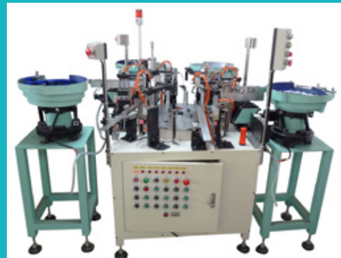
Dedicated Automatic Feeding & Assembling Machine (for 4 cosmetic parts)