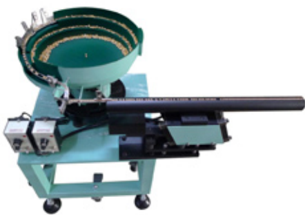
Automatic Brass-part Alignment & Orientation Feeder

Founded in 1985, Chyuan Yii Machine Work is a seasoned supplier who always does its utmost, known for auto-aligning part feeders. Supplying popular products in Taiwan and overseas, we look forward to building opportunities with customers, making to-order automated equipment that are highly regarded in many sectors. Customer-oriented, we are the best partner for mutually-beneficial business among peers. ... {read more}