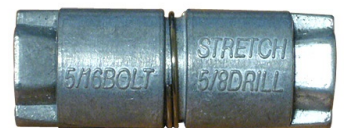
Double Expansion Shield