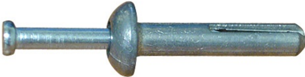
Hammer Drive Anchor