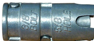
Single Expansion Shield