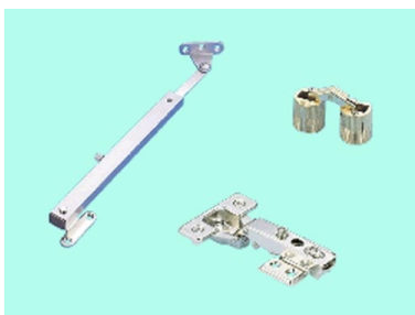
Hinges & Stays (Lid Supports)

FOUR WINDS CORPORATION is dedicated in Slides (Runners), Ground Selection, Furniture Locks, Office Fittings, Glass Door Fittings, Shelf Fittings & Swivels, Catches & Latches, Hinges & Stays, Table, Bed & Wardrobe Fittings, Sliding & Folding Door Fittings, Connecting Fittings and Fasteners, Utility Hooks, Mirror Fitting, Tube Fitting & Bumpers, Jewe ... [more]