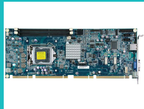
PSB-873LF - PICMG1.3