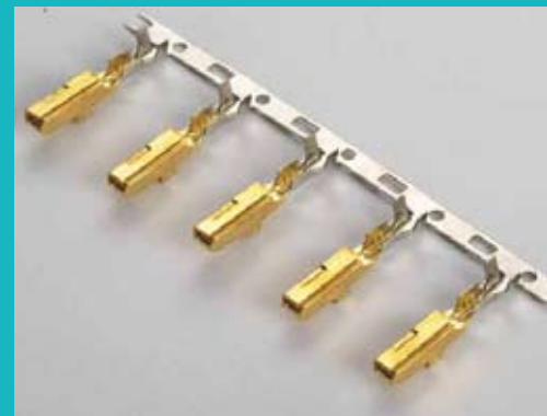
Automotive & motorbike terminals