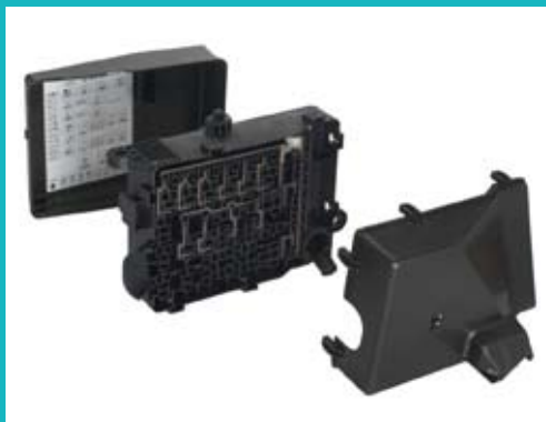
Automotive relay box

Here at Hu Lane Associates Inc., incorporated in 1977, we have spared no effort to devote ourselves to the development of terminal products oriented to cars and motorcycles. As always, we supply and serve customers with superb products and services with the utmost possible faithfulness and pragmatic attitude.