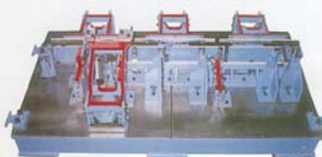
Jigs & fixtures for auto- motorcycle bodywork

Clamping and Sensing Devices for Processing Auto And Motorcycle Sheet Metal Plates and Racks