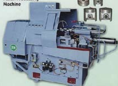
Piston Processing Machine