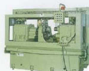
Two-way, 15-spindle precision boring machine for motorcycle crankcases

Precision Two-Way 15-Spindle Engine Crank Case Boring Machine