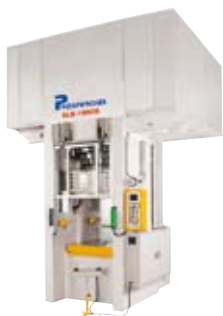
hydraulic forging press

Hsin Lien Sheng Machinery Co., Ltd. makes hydraulic press, 180-degree reversing-type spotting press, hemming machine, high-speed hot/cold forging press, and single/double crank press. The 180-degree reversing-type spotting press is certified with CE.