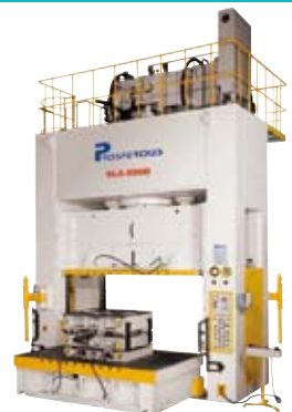
deep drawing press