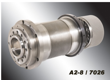
A2-8 / 7026

Founded by a former engineering supervisor of Yang Iron Works, a renowned local machinery manufacturer, Ju Rui Fu Machinery is a seasoned spindle builder and installer. Partnering with three major bearing makers as Japan's NSK, NTN and Germany's SKF, we build precision, heavy-duty spindles for CNC machine tools as lathes, milling machines etc. To m ... [more]