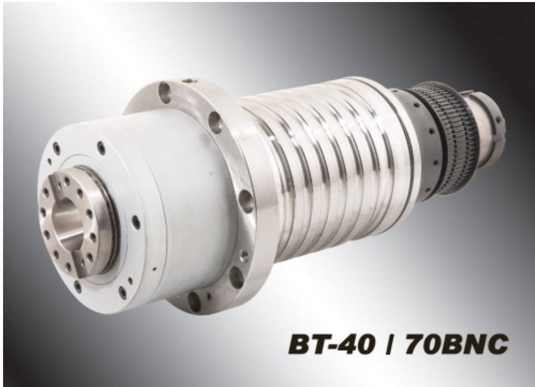
BT-40 / 70BNC