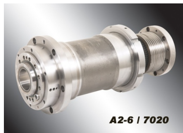
A2-6 / 7020