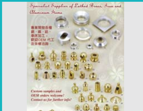
Lathed Brass, Iron and Aluminum Items