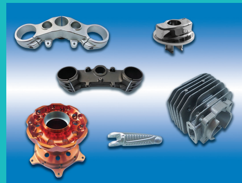
Motorcycle Parts & Automobile Parts