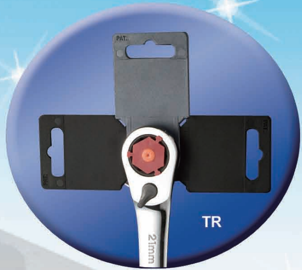
Anti-theft hang card / Wrench hang card