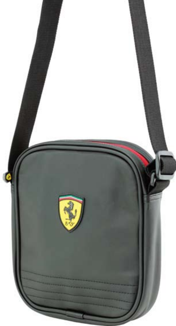
Ferrari Shoulder Bag