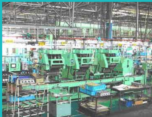
4-axis CNC Engine-Cylinder-Head Oil-Seal Inserting Machine