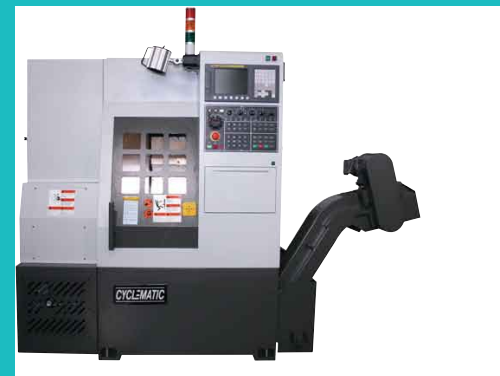
Slant-bed-type CNC Lathes