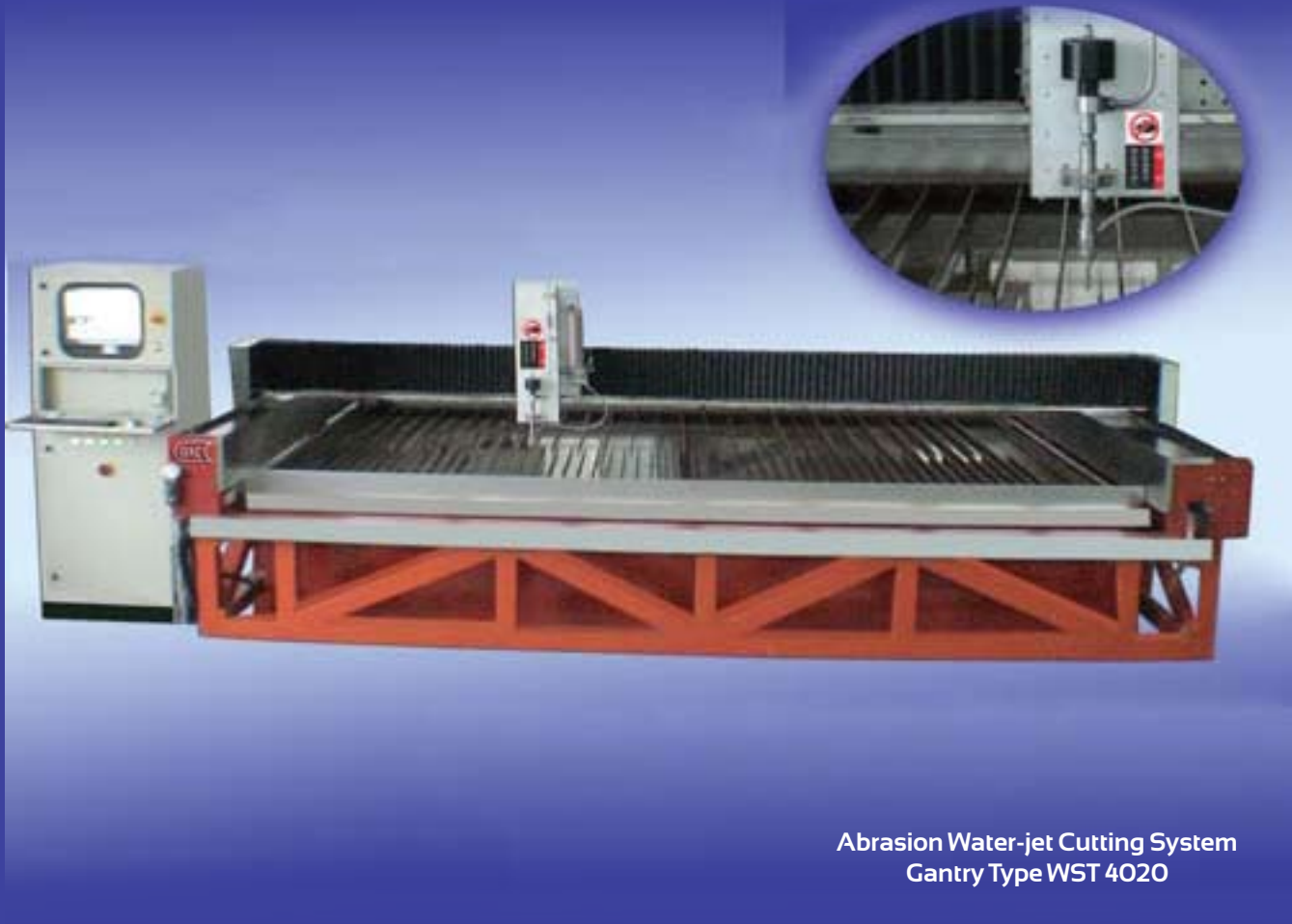
Abrasion Water-jet Cutting System Gantry Type WST 4020