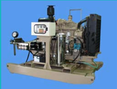
UHP Cleaning System