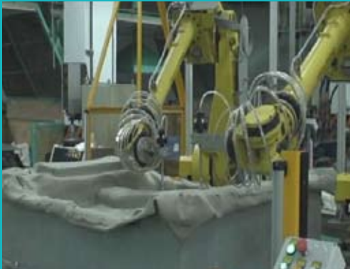
Robot Cutting System ABB FUNAC YASKAWA ROBOT