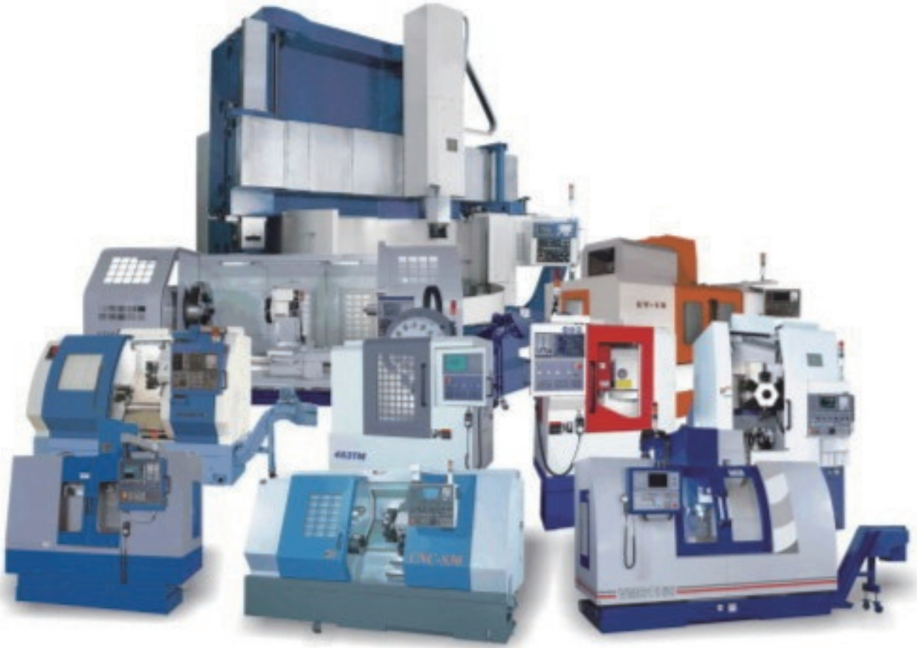
Machining Centers, Vertical