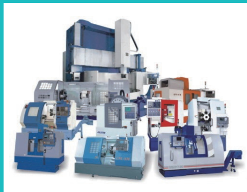
Machining Centers, Vertical