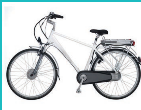
EPAC / EN 15194 Electrically Power Assisted Cycles (EPAC) Services