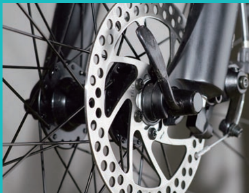
Bicycle Components Testing Services

Intertek is the industry leader with more than 36,000 people in 1,000 locations in over 100 countries. Whether your business is local or global, we can ensure your products meet quality, health, environmental, safety, and social accountability standards for virtually any market around the world. We hold extensive global accreditations, recognitions, and agreements, and our knowledge of and expertise in overcoming regulatory, market, and supply chain hurdles is unrivalled.