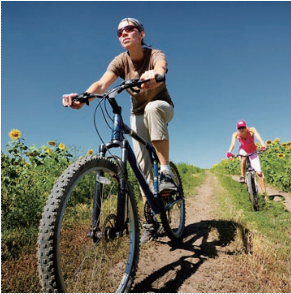
Bicycle Testing Services