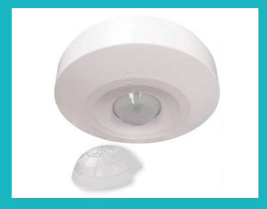
PIR Lighting Sensor with Transmitter

JOY LIFE ELECTRONIC CO., LTD. is an ISO9001 approved company. JOY LIFE started its wireless car alarm equipments and car alarm accessories business in 1986. In 2010 we started to develop high-quality PIR lighting control product series and LED-related products in order to provide total solutions to energy saving lighting.