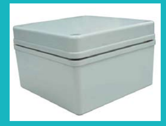
Controller with Receiver