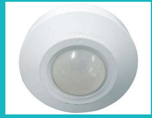
PIR Lighting Sensor with Transmitter