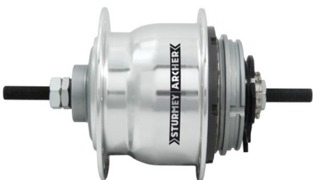
Internal gear hub