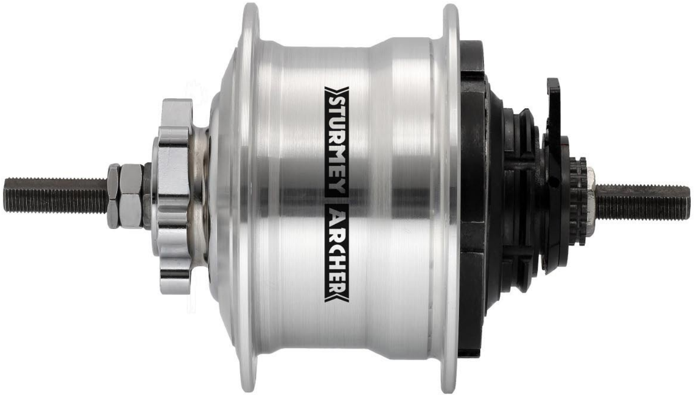
Internal gear hub