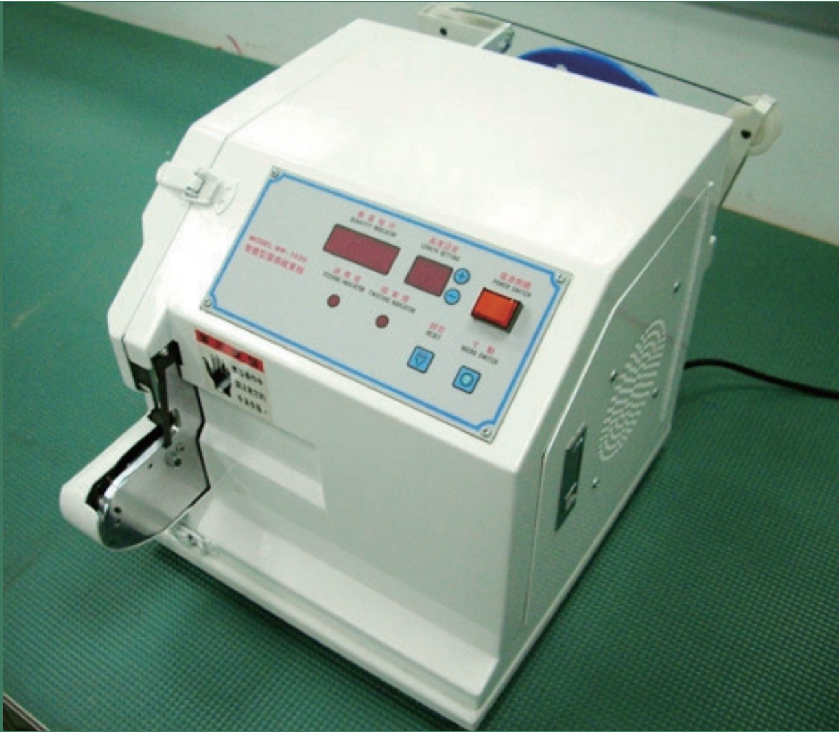
Twisting Tie Machine