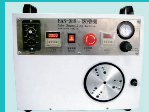
Rolling machine for SUS Tubing