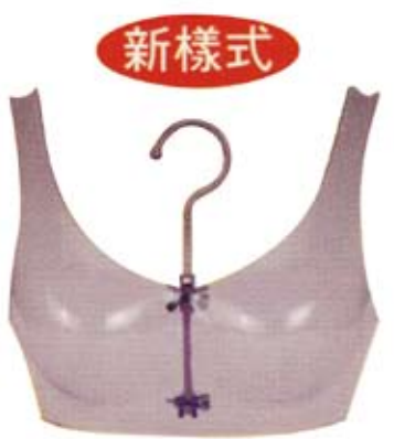
517 掛式 Free-Hanging Transparent D-cup Breast Form With Stand