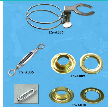
Hardware Items for Fabric-covered Carports